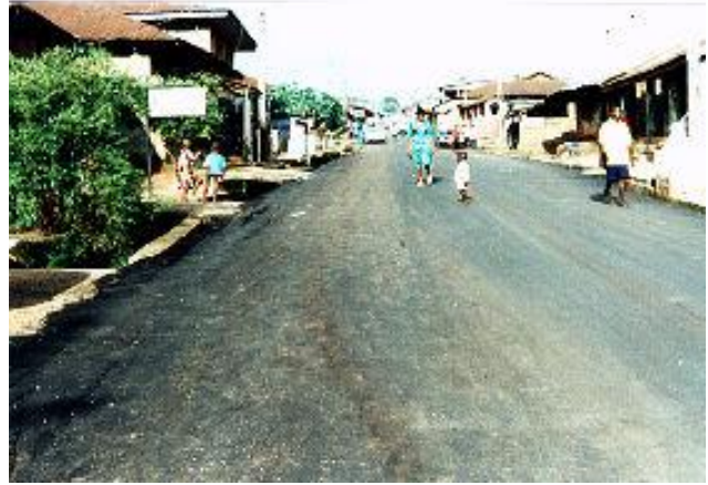
A circa 2007 photo of Gbenoba Road.

This photo was taken at 6C Wilkinson Road, Onitsha, circa 1955, during the ceremony of her initiation into the Otu Odu (Ivory Society), the most prominent women organization in Onitsha.